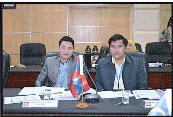
SAI Lao PDR