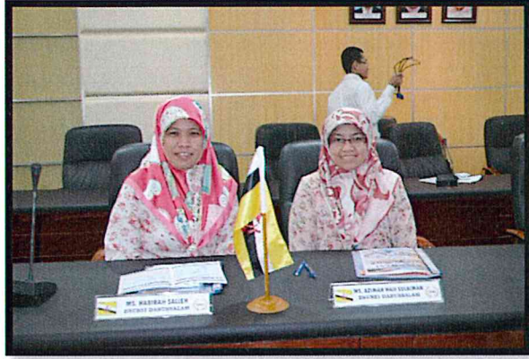
SAI Brunei Darussalam